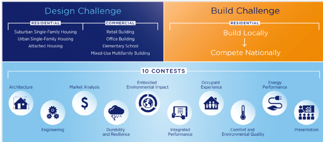
Figure 1. Structure of the Solar Decathlon

Overall, the Solar Decathlon gives teams the option to participate in either the Design Challenge or the Build Challenge . Teams entering the Build Challenge design and build a residential unit in their local community. All teams are evaluated across 10 Contests. Just like athletic decathlons, teams must perform well across all 10 Contests to be victorious. Figure 1 provides a graphic depiction of the various competition options. For more information on the competition as a whole, read the Solar Decathlon Competition Guide .