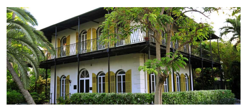
Figure 1: Hemmingway House in Key West, FL

Team Daytona Beach was particularly influenced by the iconic Hemmingway House. The home is known for its high, arched windows and spindly, cast-iron porch rails. The team took these features and broke them down to their most basic elements, high arches and thin lines. These basic elements were used to create the team's branding suite.