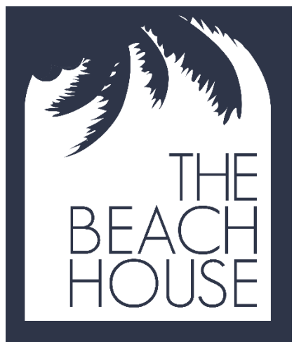
Figure 3: The BEACH House Logo